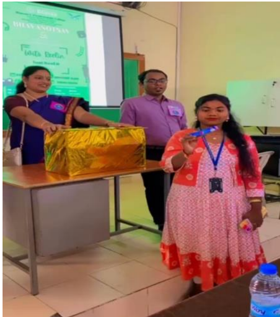
Participants Picking a product.