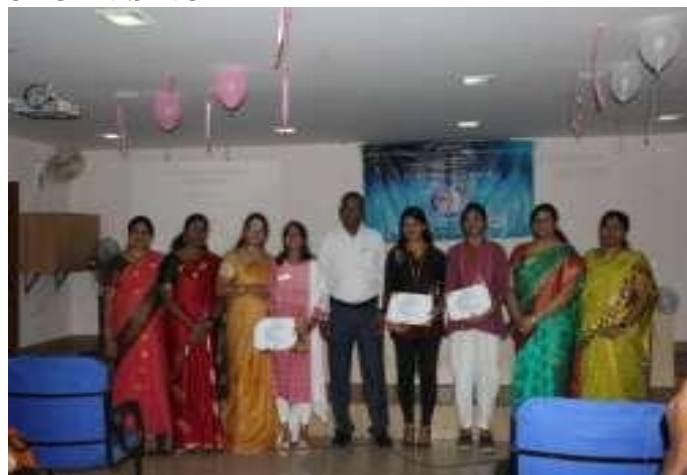
CVO & DCVO's WITH LECTURERS