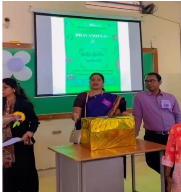
Lecturer in charges briefing about the event.