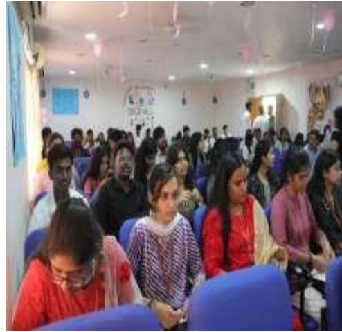
STUDENTS OF THE CLUB